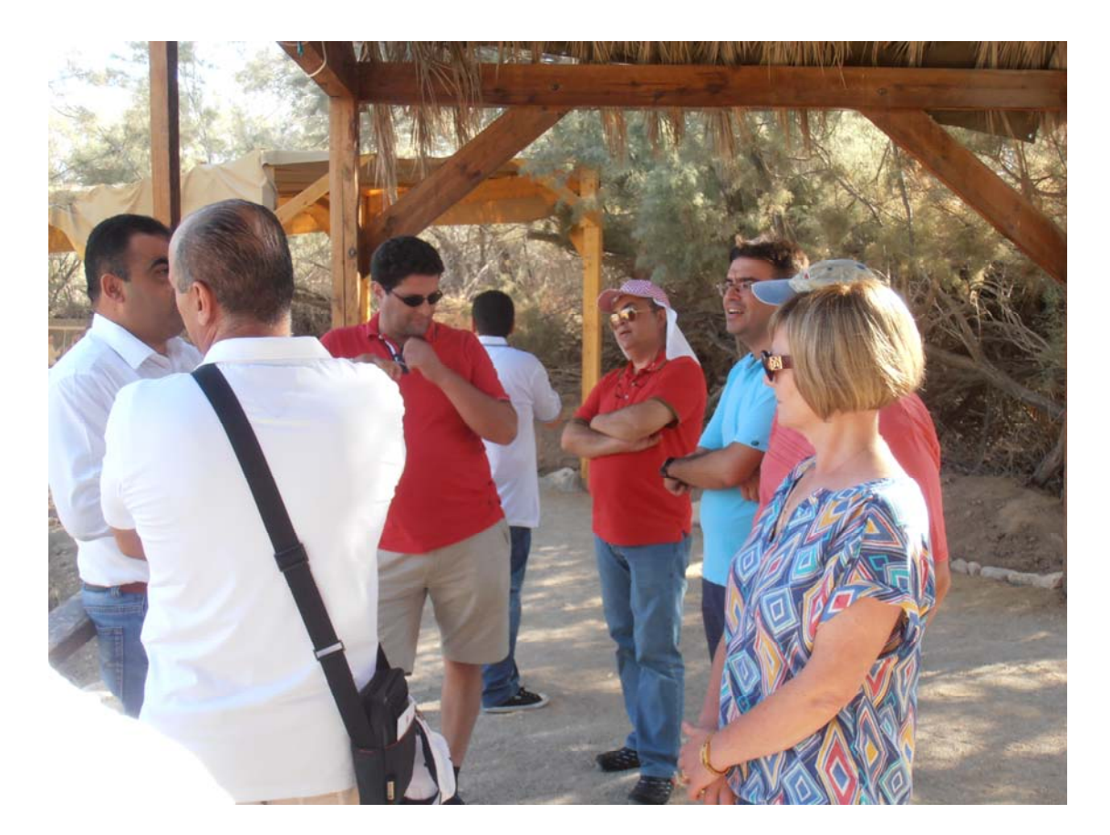
With our guide at the Baptismal Site on the River Jordan